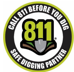
Safe Digging Partner