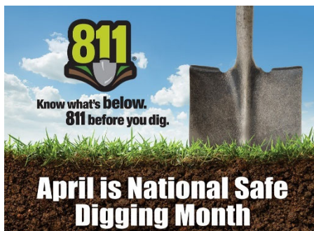
Safe Digging Month